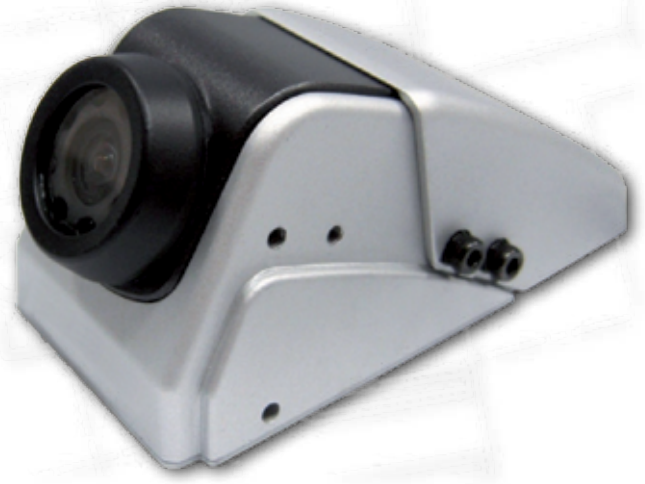
Assembly Option 2: